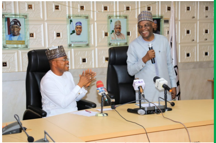
HE Usman Ododo of Kogi state Pay a courtesy visit to TETFUND for consultations

The vaccine development is definitely a game changer given the fact the remarkable achievement was recorded by a consortium of indigenous scientists, who are also currently working on the development of Lassa fever vaccine amongst many others. Perhaps there's nothing more disheartening than watching the number of unemployed graduates grow, year-on-year, with few employment opportunities in sight. Lack of rewarding job engagement has devolved into cataclysmic waves of advance fee fraud, armed robbery, prostitution, drug trafficking, kidnapping and general restiveness among Nigerian youths, today. Yet, a considerable number of graduates being churned out are either deemed unfit for purpose, or generally unemployable by few organizations that are hiring. Recently, TETFund commenced the "Employability Benchmarking Programme" in Nigeria's tertiary institutions in active collaboration with the International Finance Corporation (IFC), and other partners, as a way of tackling the composite challenges of unemployment (33%); youth unemployment (42.5 %) and youth underemployment (21%), as lately put out by the National Bureau of Statistics.